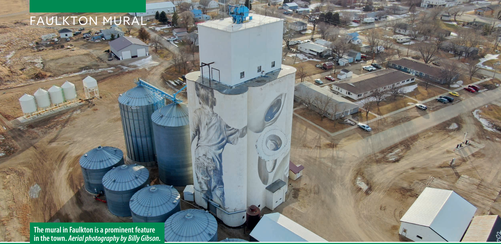
The mural in Faulkton is a prominent feature in the town.