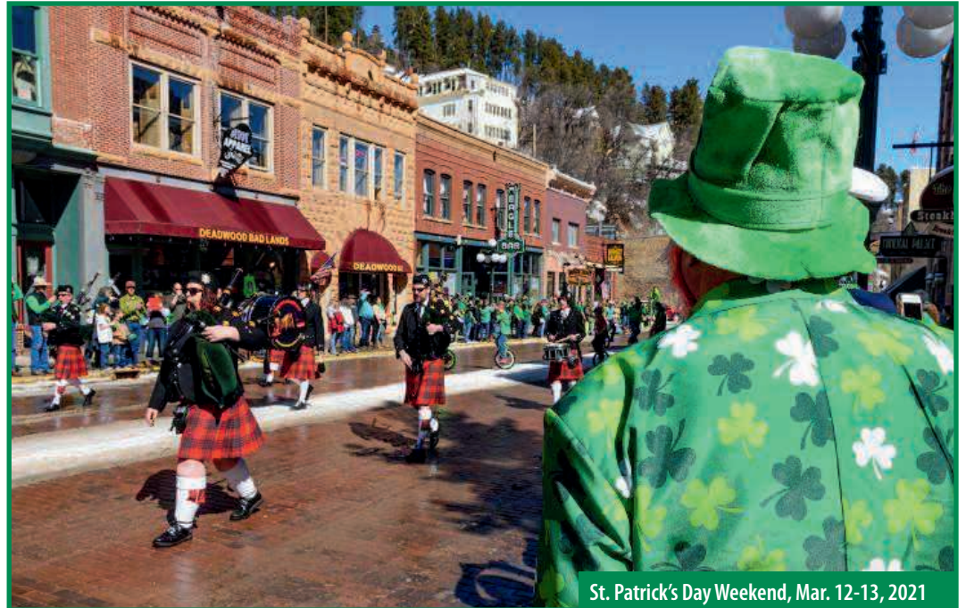
St. Patrick's Day Weekend, Mar. 12-13, 2021

St. Patrick's Day Weekend, Main Street, Deadwood, SD 605-578-1976