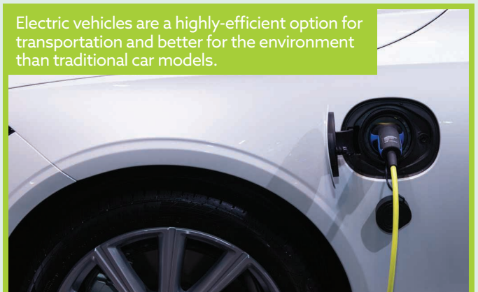
Electric vehicles are a highly-efficient option for transportation and better for the environment than traditional car models.

CHARGE EV was created by 29 electric cooperatives spread across Illinois, Iowa, Minnesota and Wisconsin to help promote EV adoption and create a national charging network. Electric cooperatives serve more than 42 million people across 48 states. More information can be found at www.charge.coop .