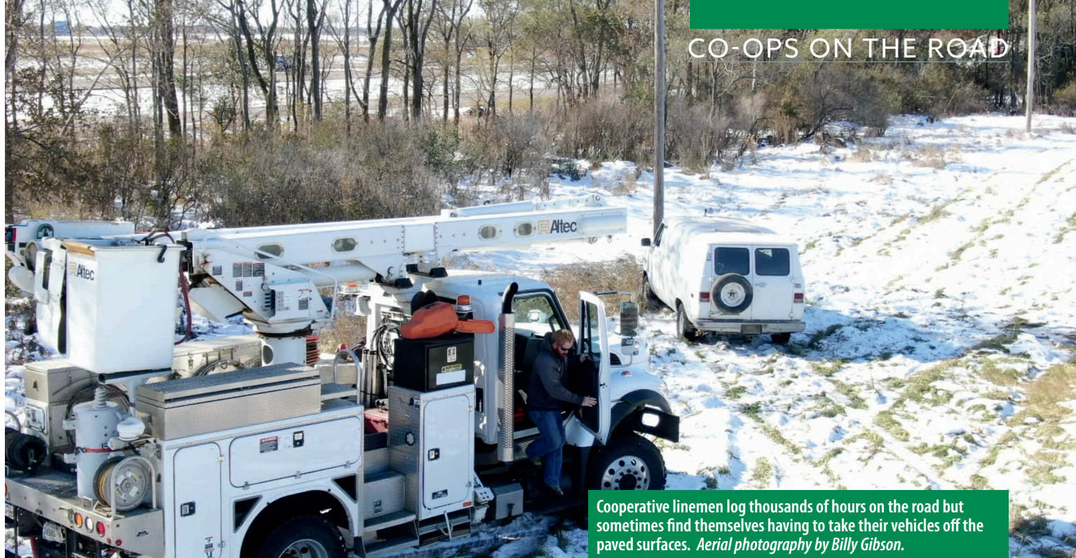
Cooperative linemen log thousands of hours on the road but sometimes find themselves having to take their vehicles off the paved surfaces.